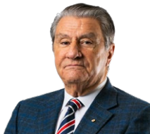
NICK POLITIS AM